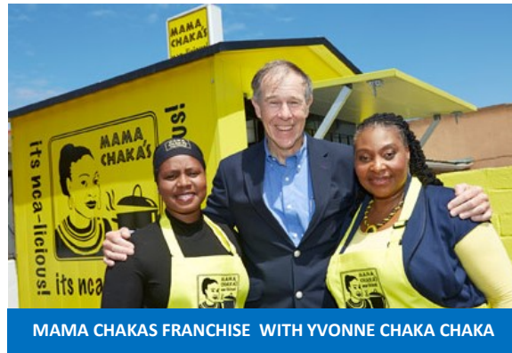
MAMA CHAKAS FRANCHISE WITH YVONNE CHAKA CHAKA