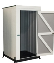
1,2m x 1,2m