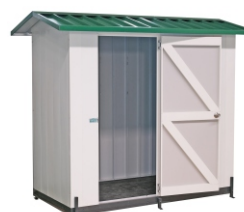
1,2m x 2,4m