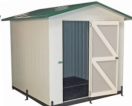
2,4m x 2,4m