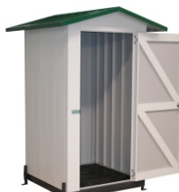
1,2m x 1,2m