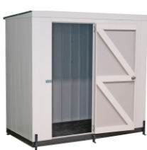
1,2m x 2,4m