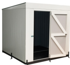
2,4m x 2,4m