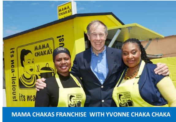
MAMA CHAKAS FRANCHISE WITH YVONNE CHAKA CHAKA