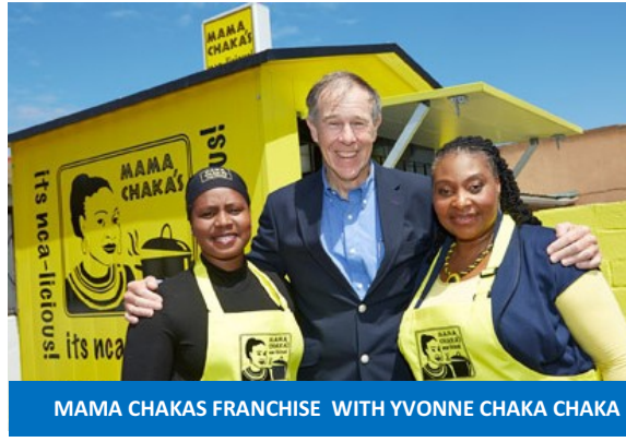
MAMA CHAKAS FRANCHISE WITH YVONNE CHAKA CHAKA