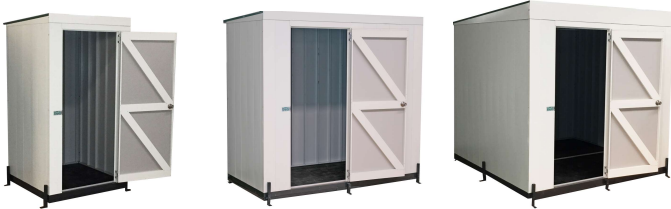
1,2m x 1,2m