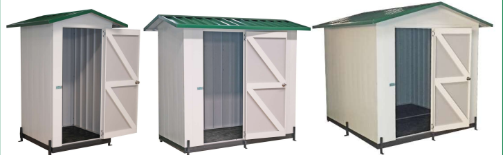
1,2m x 1,2m