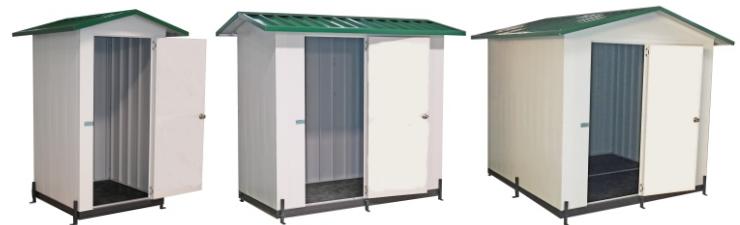
1,2m x 1,2m