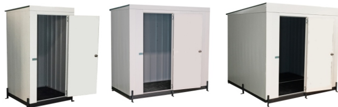
1,2m x 1,2m