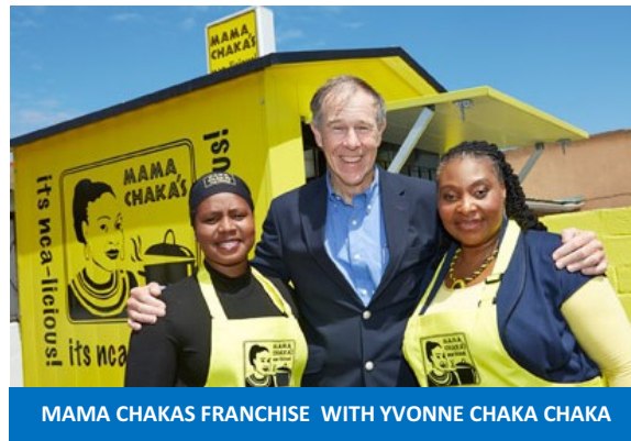
MAMA CHAKAS FRANCHISE WITH YVONNE CHAKA CHAKA