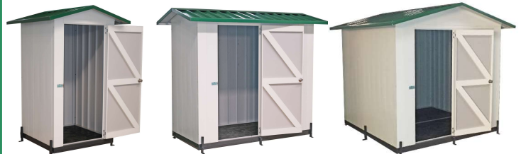
1,2m x 1,2m 1,2m x 2,4m 2,4m x 2,4m