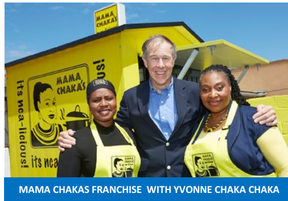
MAMA CHAKAS FRANCHISE WITH YVONNE CHAKA CHAKA