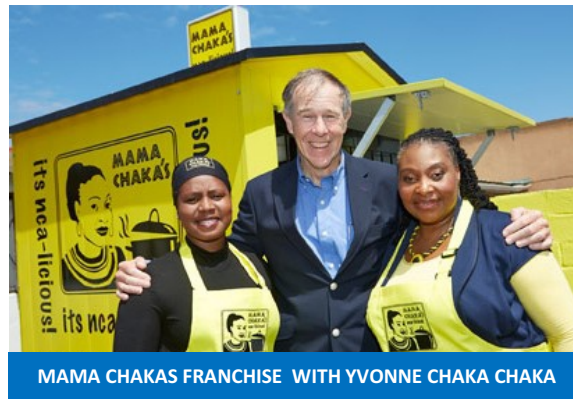
MAMA CHAKAS FRANCHISE WITH YVONNE CHAKA CHAKA