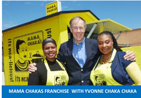
MAMA CHAKAS FRANCHISE WITH YVONNE CHAKA CHAKA