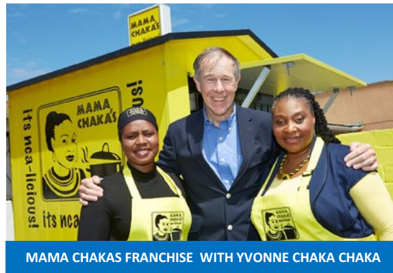
MAMA CHAKAS FRANCHISE WITH YVONNE CHAKA CHAKA